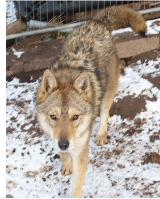
Alba Skuli (Bear)

Website: http://www.tamaskanbreeders.com